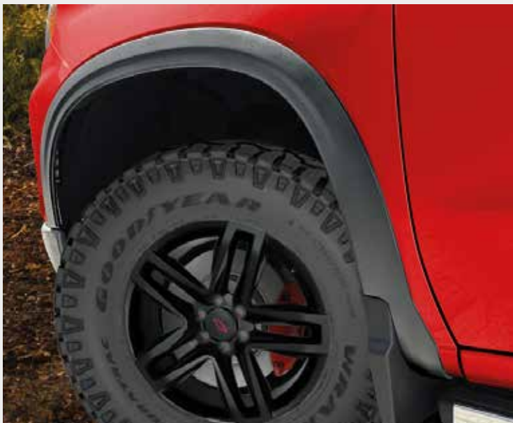
Front OE Style Fender Flares