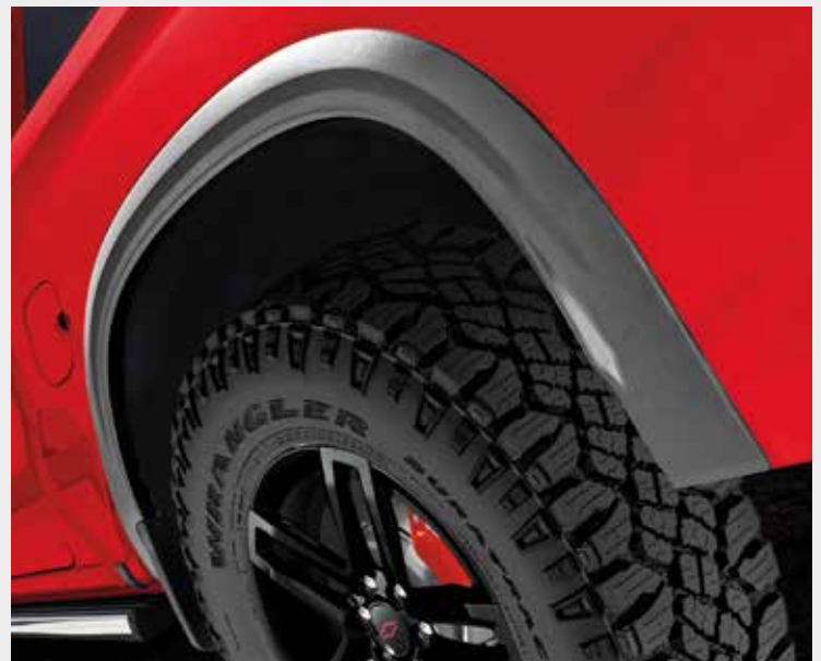
Rear OE Style Fender Flares