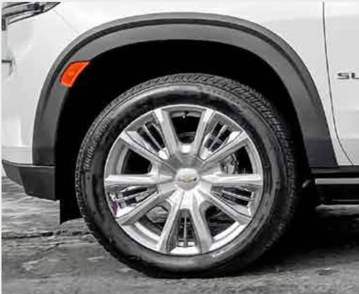
Front OE Style Fender Flares