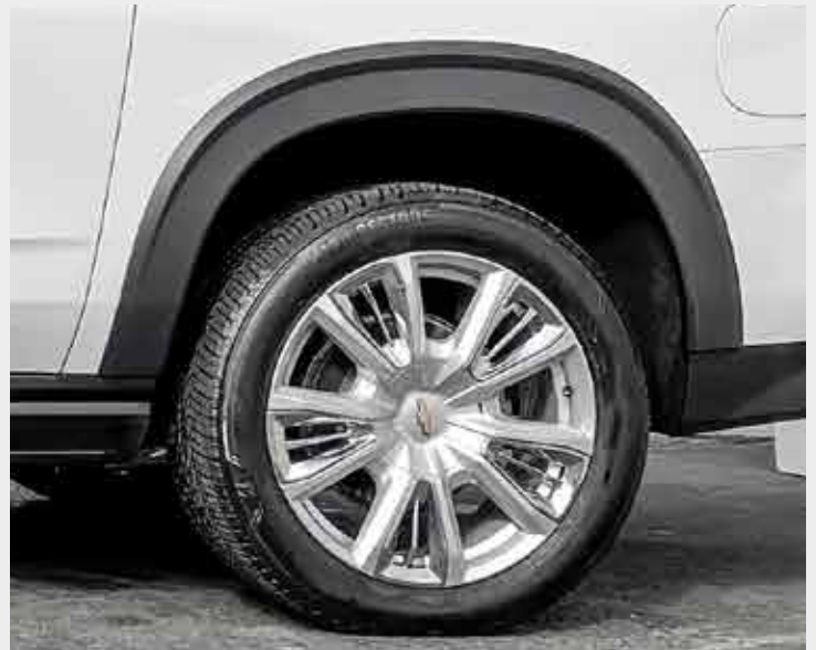
Rear OE Style Fender Flares