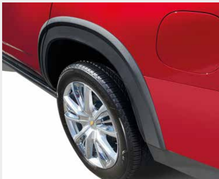
Rear OE Style Fender Flares