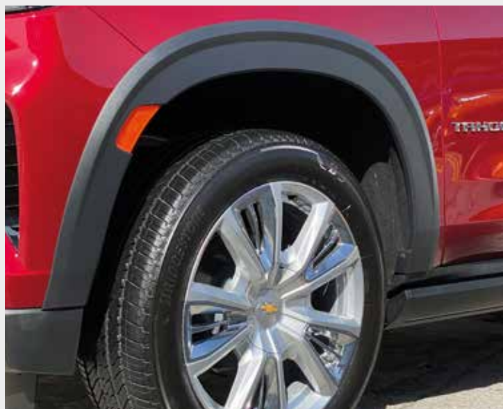
Front OE Style Fender Flares